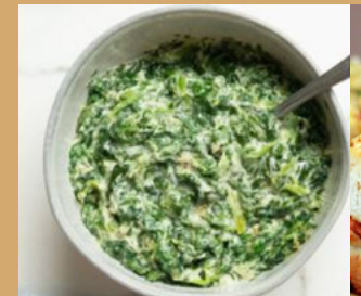
Creamed Spinach Homemade $13.90