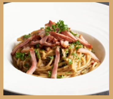
Creamy Smoked Duck