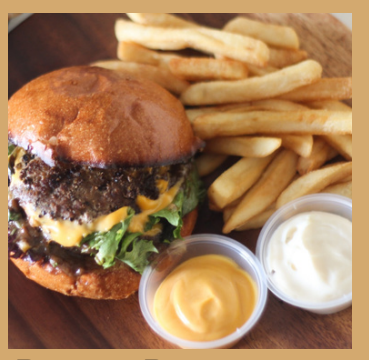
Beast Burger (double beef patties) (Triple beef patties) $25