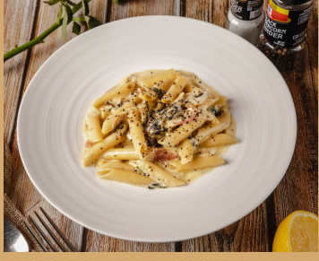
Creamy Mushroom Carbonara