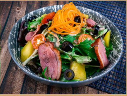
Smoked Duck Salad $14.90