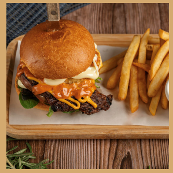
Steak Burger $33.90