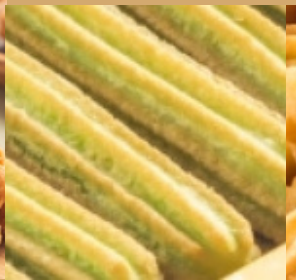
Churros (Pandan) 5 for $9.90