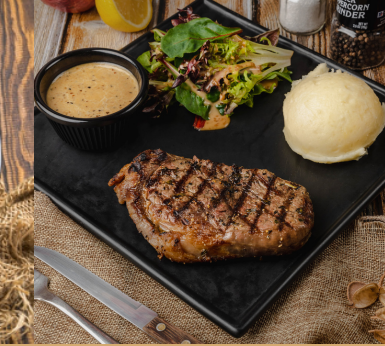
New York Strip 300g $27.90

Served with salad and one side (mash or fries) and one homemade sauce (separately served). Top up $3 to upgrade to sweet potato fries / curly fries