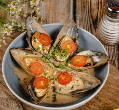
Creamy Mussels with bread 6pcs $14.90