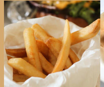
French Fries $11.90* + truffle oil $2