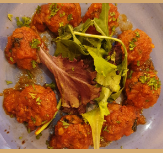
Beef Meatballs 8 for $14.90