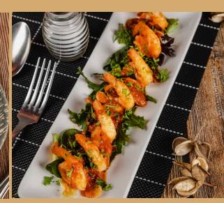
Spicy Gamberoni (prawns) $14.90