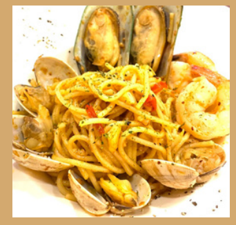
Seafood Tom Yum Salted Egg Yolk