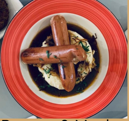
Banger & Mash $15.90

Absolutely tender and melts in your mouth. Served with homemade mash