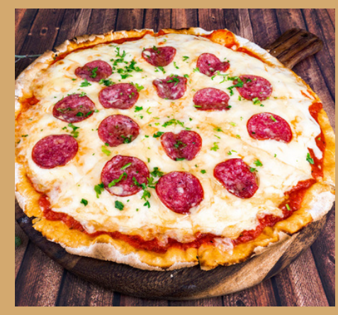
Beef Pepperoni $25