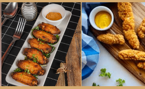
Buffalo Wings Chicken Tenders 6 for $9.90 6 for $7.90