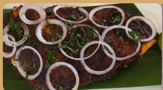
Sambal Seabass Appetiser $14.90