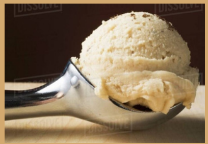
Ice Cream (assorted flavours) $4 per scoop +1 premium flavours