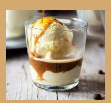
Vanilla Affogato (Ice Cream in Vanilla Espresso) $9