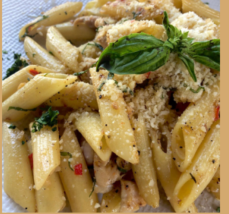
Chicken Aglio Olio