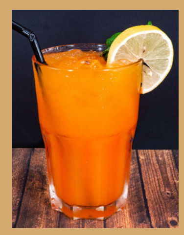
99 Sunset Fruitpunch (non-carbonated)