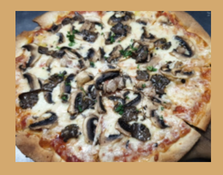
Truffle Mushroom $28