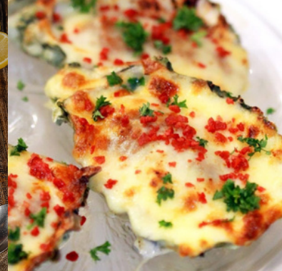
Baked Oysters (spicy) 6pcs $43.90 12pcs $72.90