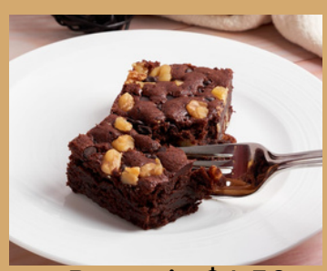
Brownie $6.50 Brownie with ice cream $8.50