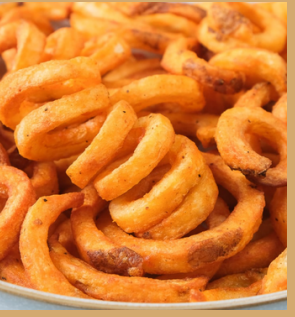
Curly Fries* $13.90