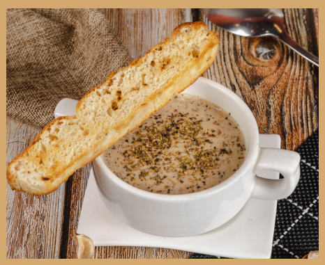
Cream of Mushroom (homemade) with focaccia bread $8.50 + truffle oil $2