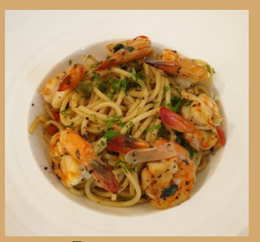
Prawn Aglio Olio