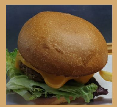
Beef Burger $22

All burgers are served with fries (top up $3 to upgrade to sweet potato / curly fries