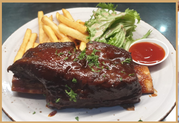
Angus Beef Rib Personal Size $42.90

Oven roasted signature beef rib coated with smokey barbeque sauce. Tender and fully cooked. Served with fries and salad