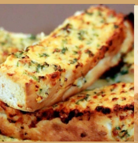
Garlic Bread 5 pcs $9.90