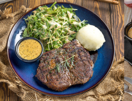
Ribeye 425g $53.90