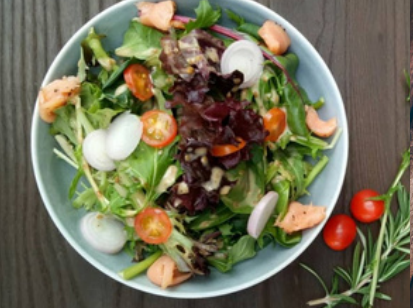
Smoked Salmon Salad $14.90