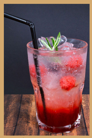
Lychee Elderflower Strawberry Rosemary