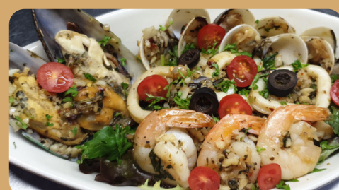
Sauteed Seafood $14.90