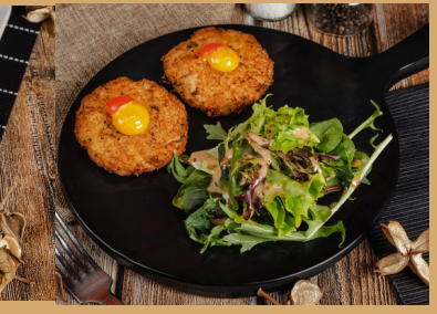
Crispy Crabcake 2 for $12.90