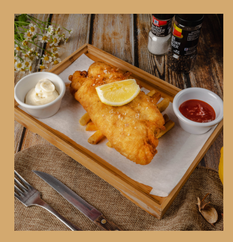
Fish & Chips $19.90