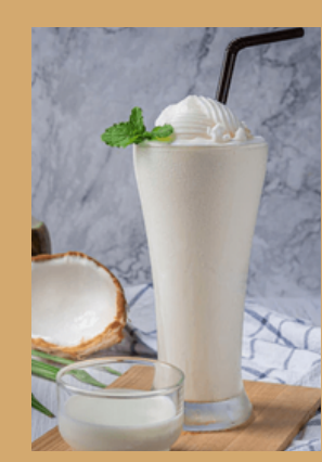
Coconut Shake with Coconut Icecream $9.9