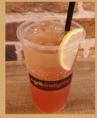
Grapefruit Apple Cooler