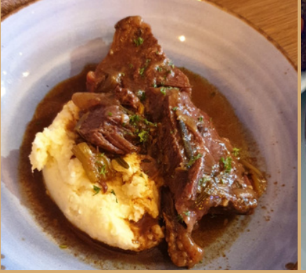
Beef Cheek $27.90

Oven roasted signature beef rib coated with smokey barbeque sauce. Tender and fully cooked. Served with fries and salad