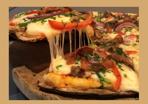
Meat Lover $26