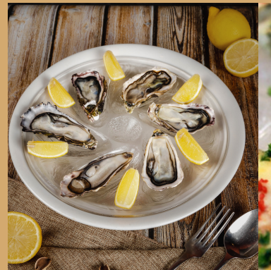
Fresh Oysters 6pcs $33.90 12 pcs $62.90