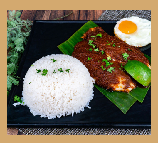
Sambal Seabass Set $19.90