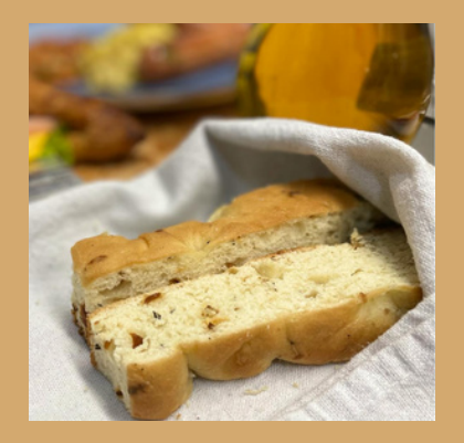
Homemade focaccia bread $1 per slice