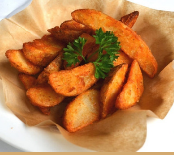
Potato Wedges* $12.90