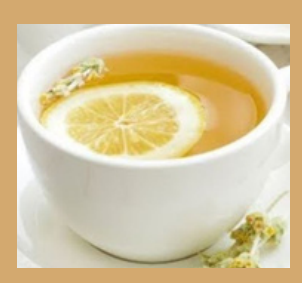
$5 per cup