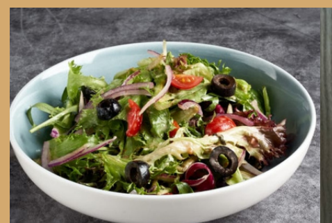
Garden Salad $11.90