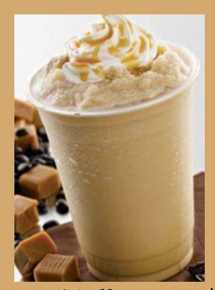
Nutella Brownie Caramel Coffee Frappe $9 Matcha Latte Frappe Butter Bandung $12 Wanilla Coffee Frappe $9 With Ice Cream $9.90 $9