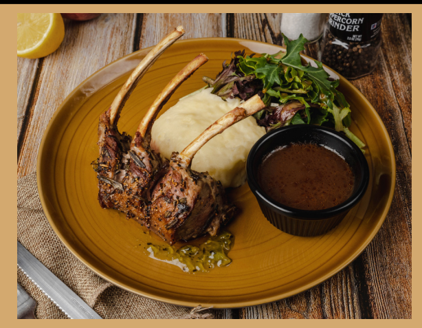
Pan Seared Lamb Rack (served with mash) $36.90