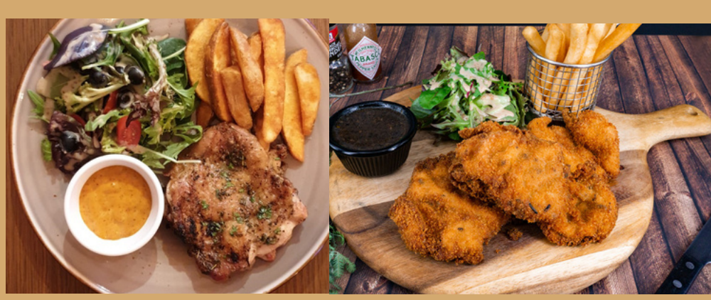
Grilled Chicken & Wedges $19.90