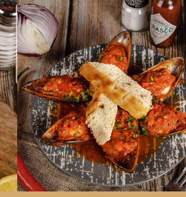
Spicy Mussels with bread 6pcs $14.90