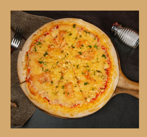
Smoked Salmon $26