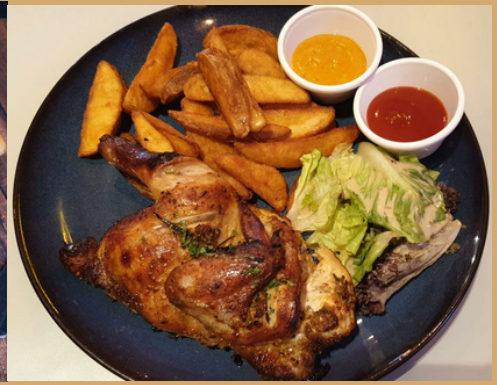
Chicken Diavola with wedges (Half Chicken) (mild spicy) $23.90