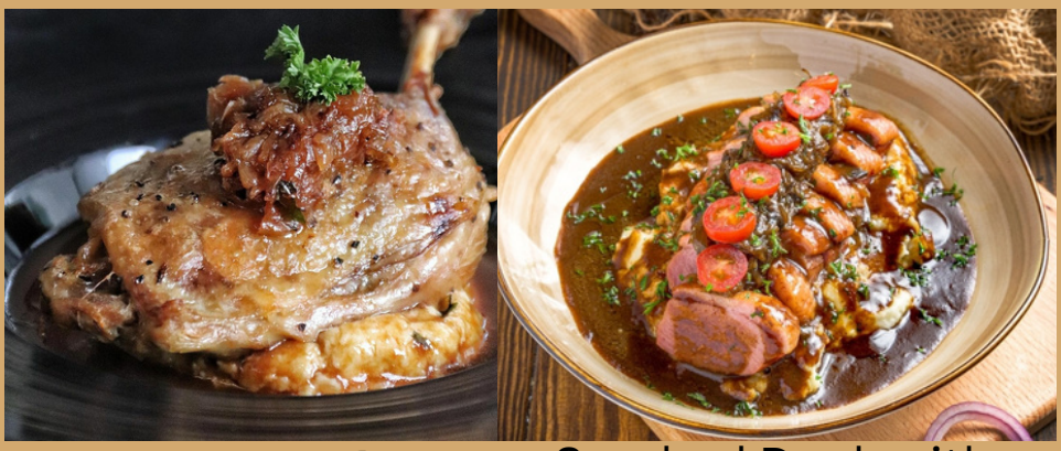
Duck Confit $25.90