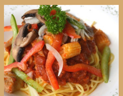
Vegetarian (Aglio Olio)* contains garlic & onions