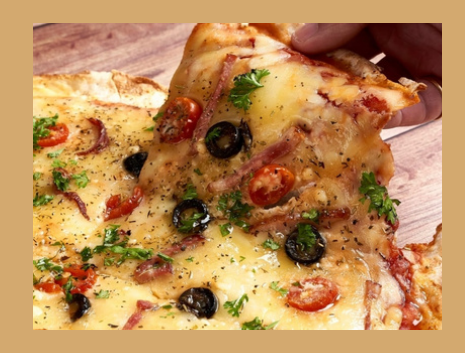
Smoked Duck $26