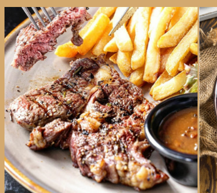
Ribeye 200g $33.90