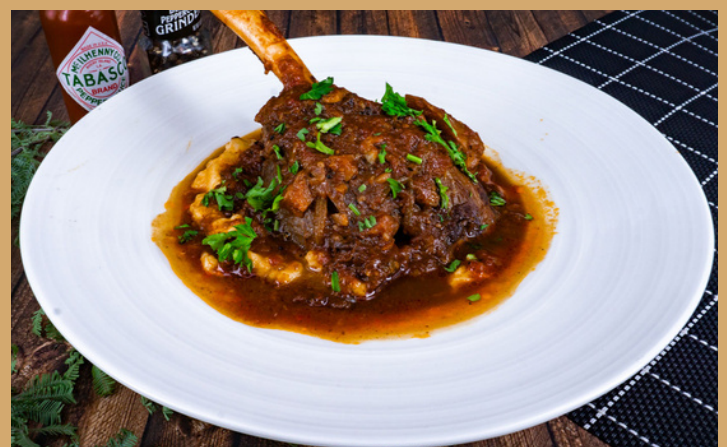
Braised Lamb Shank (served with mash) $27.90