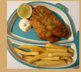
Little Fish and Chips $13.90