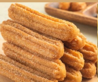
Churros (Original) 5 for $8.90