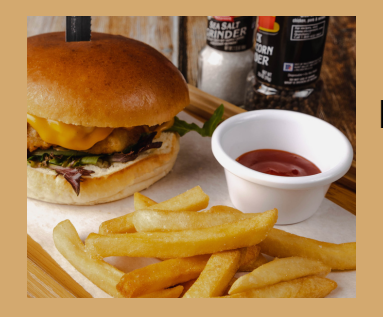
Fisherman's Burger $22