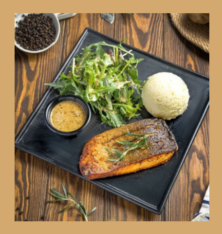
Salmon (served with mash) $23.90