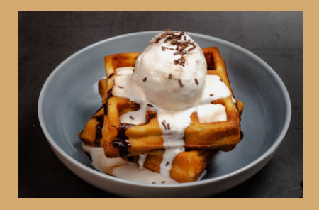
Waffles with ice cream $13.90 (waiting time 15 min)